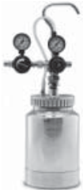
IQ™ -2Q Two-Quart Pressure Cup Assembly ..... Part #8075 Includes: Dual Regulator Assemblies and Gauges Double 5 ft. (1.5m) Fluid/Air Hose #7128 (Not Shown)