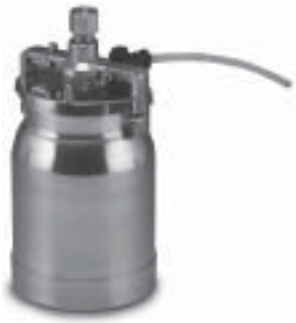
IQ™ One-Liter Pressure Cup Assembly ..... Part #9300 With Swivel Tubing Connector For Use With: All Mattson systems except IQ™ Top-Load and Crossfire™.