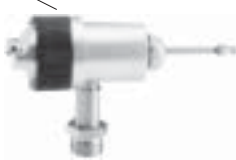
Black, Gold, Green or Silver Ring

For Use With: All Mattson Spray Heads and Gun Handles except CrossFire™.