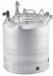
CrossFire™ 2-Gallon (7.6 L) Stainless Steel Tank ..... Part #7206 For Use With: CrossFire™ System A