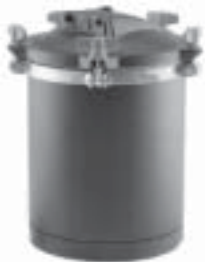
CrossFire™ 2.5-Gallon (9.5 L) Tank ..... Part #7205 For Use With: CrossFire™ System B