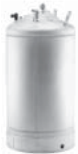
CrossFire™ 10-Gallon (38 L) Stainless Steel Tank ..... Part #7207 For Use With: CrossFire™ System A