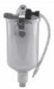
IQ™ Top-Load (20-fl oz (590ml) Aluminum) Pressure Cup Assembly ..... Part #8500 With Blue Gasket For Use With: IQ™ Top-Load Systems