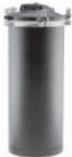
CrossFire™ 5-Gallon (19 L) Tank ..... Part #7210 For Use With: CrossFire™ System B