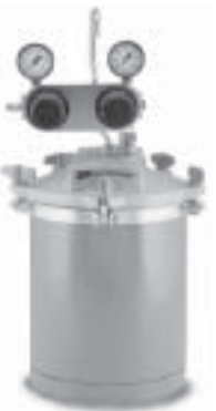
IQ™ -CC ColorCan Paint Tank Assembly ..... Part #8040 Includes: 2.5 Gallon Paint Tank Dual Regulators and Gauges